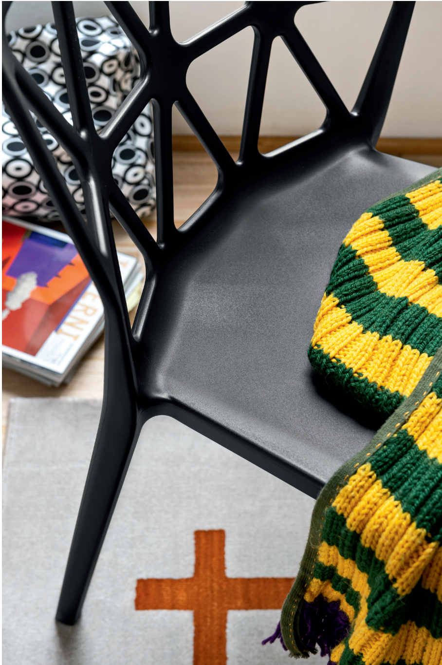
Alchemia CB1056 sedie | polipropilene P15 nero opaco - chairs | polypropylene P15 matt black Zeffiro CB4798-R 160 tavolo allungabile | metallo P15 nero opaco / vetro temprato GTR trasparente - extending table | metal P15 matt black / tempered glass GTR transparent App CB5212 appendiabiti | faggio P132 faggio grafite / metallo P15 nero opaco - coat stands / hangers | beech P132 graphite / metal P15 matt black Cek CB7257-B tappeto | polipropilene/poliestere tonalità di beige/zafferano - rug | polypropylene/polyester Hues of beige/saffron yellow