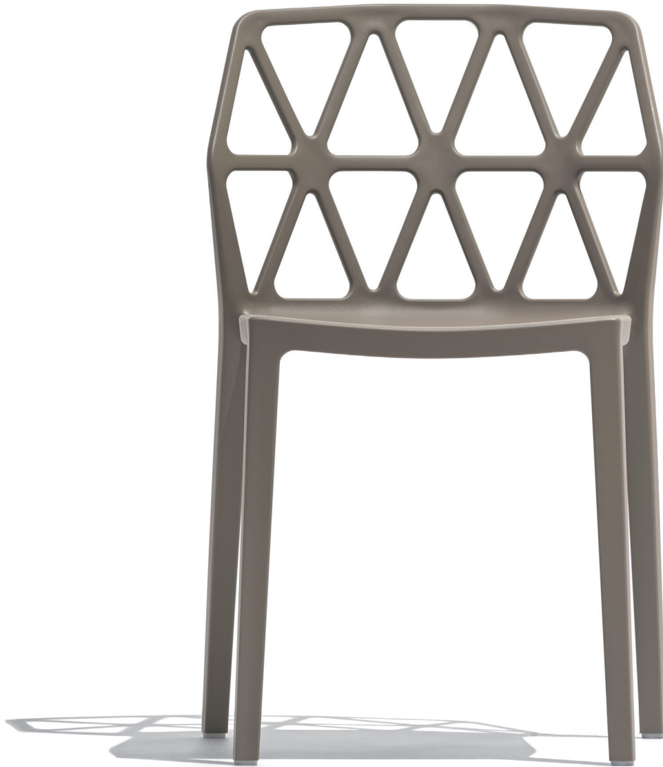
Alchemia CB1056 sedia | polipropilene P900 tortora opaco chair | polypropylene P900 matt taupe