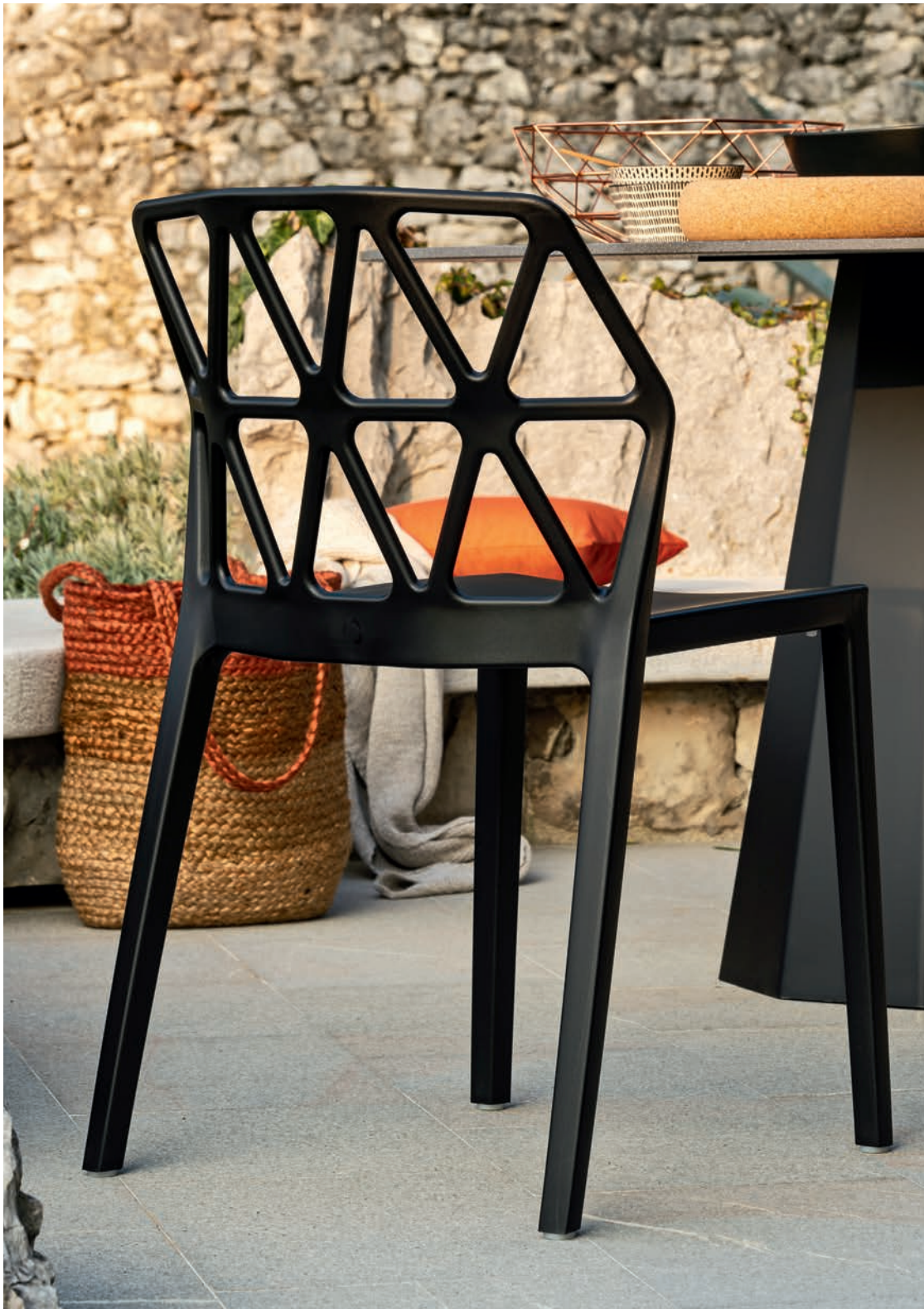
Alchemia CB1056 sedie | polipropilene P15 nero opaco - chairs | polypropylene P15 matt black Dix CB4804-FD 120 E tavolo fisso | metallo P15 nero opaco / ceramica P22C cardoso nero - non-extending table | metal P15 matt black / ceramic P22C cardoso black